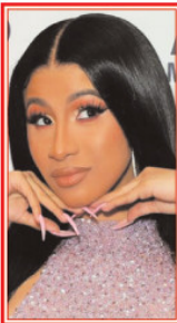
Cardi B Explodes As She Breaks Silence On Child Protective Services Raiding Her Home