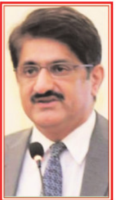
Murad Unveils Jaw-Dropping Rs6 Billion Infrastructure And Energy Projects In Karachi