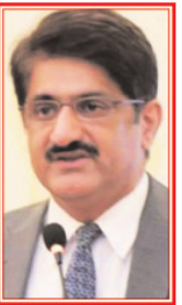
Murad Demands Fast-Track Approval of Rs75.639 Billion Worth Development Schemes For Karachi