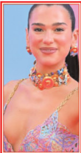
Dua Lipa Leaves Fans Heartbroken With Underwhelming Live Performance