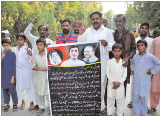
HYDERABAD: Members and leaders of the Mehran Workers Union are holding a protest demonstration against the non-payment of their salaries, at the Hyderabad press club.