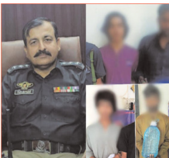
By GM Chandio

HYDERABAD: Hyderabad Police in the jurisdiction of the Hussainabad Police, during patrols, apprehended four suspects along with weapons, narcotics, and alcohol on Friday. Notably, drug supplier Bilal Burro was arrested near Nagoshah Cemetery with ten liters of illicit alcohol. Additionally, street criminal Ameer Bux Jamali was caught near Mehran Oil Mills with a 30 bore pistol and ammunition. From Unit Number 4 Latifabad, drug