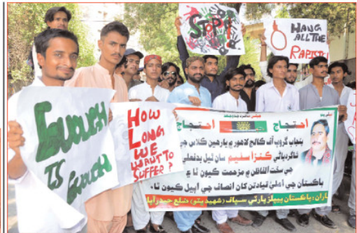
HYDERABAD: Activists and leaders of the Pakistan Peoples Party Shaheed Bhutto (PPP-SB) are holding a protest demonstration against the alleged rape of a first-year female student by a security guard in college premises in Lahore, at the Hyderabad press club.