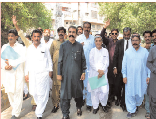
HYDERABAD: Members and leaders of the Dadu Awami Forum are holding a protest demonstration against their local District Health Officer, at the Hyderabad press club.