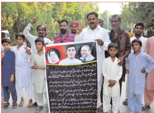
HYDERABAD: Members and leaders of the Mehran Workers Union are holding a protest demonstration against the non-payment of their salaries, at the Hyderabad press club.