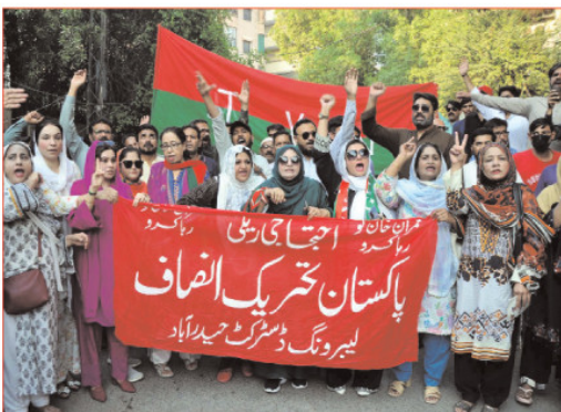
HYDERABAD: Activists and leaders of the Pakistan Tehreek-e-Insaf (PTI) are holding a protest demonstration for the release of PTI Founder Imran Khan, at the Hyderabad press club.