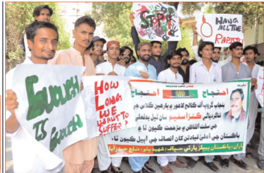
HYDERABAD: Activists and leaders of the Pakistan Peoples Party Shaheed Bhutto (PPP-SB) are holding a protest demonstration against the alleged rape of a first-year female student by a security guard in college premises in Lahore, at the Hyderabad press club.—RT

JACOBABAD: Deputy Commissioner Abrar Jaffar convened a meeting with health department officials to review measures taken against hepatitis. He emphasized the importance of providing comprehensive care for those affected, including access to necessary medications. Jaffar directed blood bank officials to report any patients exhibiting symptoms of Hepatitis B or C to ensure timely treatment. He stressed that hepatitis is a serious disease that requires immediate intervention to save lives.