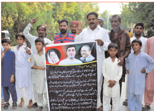
HYDERABAD: Members and leaders of the Mehran Workers Union are holding a protest demonstration against the non-payment of their salaries, at the Hyderabad press club.