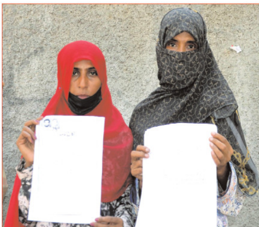
HYDERABAD: Residents of Jamshoro are holding a protest demonstration for the acceptance of their demands, at the Hyderabad press club.