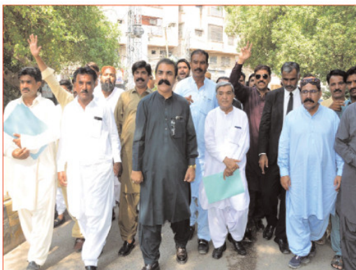
HYDERABAD: Members and leaders of the Dadu Awami Forum are holding a protest demonstration against their local District Health Officer, at the Hyderabad press club.