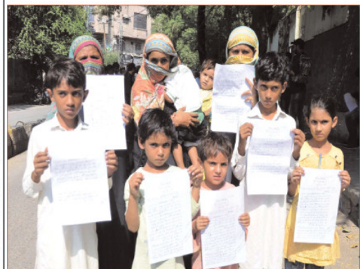
HYDERABAD: Residents of Kotri are holding a protest demonstration against the high handedness of their area police, at the Hyderabad press club.