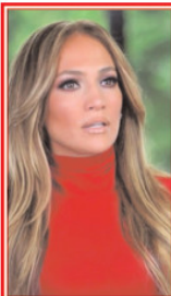
Jennifer Lopez Ready to Shine Again as Divorce Rumors with Big Ben Affleck Swirl