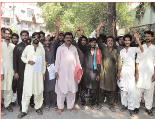
HYDERABAD: Residents of Tando Hyder are staging a protest against the high-handed actions of land grabbers, at the Hyderabad Press Club.