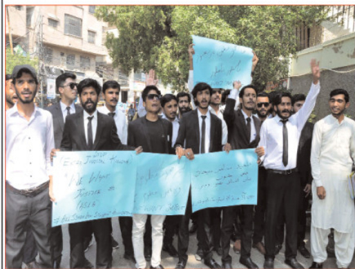
HYDERABAD: Members and leaders of the All Sindh Law Students Association are holding a protest at the Hyderabad Press Club, for the acceptance of their demands.

embark on this journey each year. They noted that decorating the rice bag incurs costs ranging from 15,000 to 20,000 rupees, but the spiritual fulfillment they gain from this act far outweighs the financial burden. The laborers' unwavering commitment to honoring their spiritual guide serves as a poignant reminder of the enduring bonds of faith and tradition that unite the people of the region.