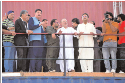
HYDERABAD: Senior Sindh Minister for Information, Transport and Mass Transit, Excise, Taxation, and Narcotics Control, Sharjeel Inam Memon, is reviewing arrangements for an upcoming public gathering of the Pakistan Peoples Party (PPP). -RT

The continued focus on eradicating illegal substances and apprehending offenders is seen as a crucial step in fostering a safer environment for residents. The police leadership has emphasized the importance of community cooperation in these efforts, urging citizens to remain vigilant and report any suspicious activities.