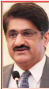
Murad's Universities Revolution: Quality Education And Digital Exam Overhaul