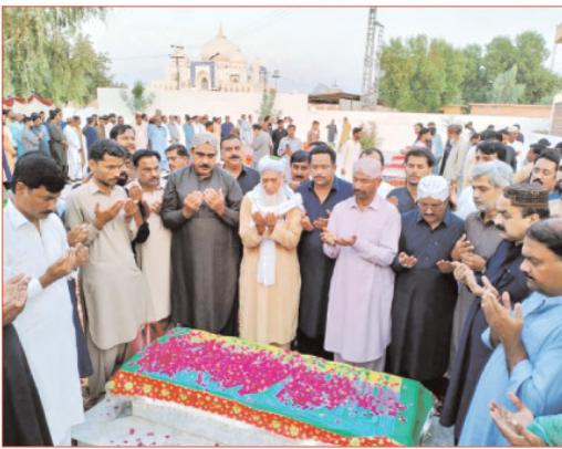
GARHI KHUDA BUX: Leaders and activists of the Pakistan Peoples Party (PPP) shower rose petals and offer Fateha for the martyrs of the 2007 Karsaz carnage on the 17th anniversary of the tragic event, at the graves in Garhi Khuda Bux.