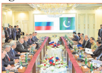
Prime Minister Shehbaz Sharif and Russian Prime Minister Mikhail Mishustin during a meeting.

Both sides agreed to enhance cooperation at multilateral forums, including the United Nations (UN) and the Shanghai Cooperation Organisation (SCO).