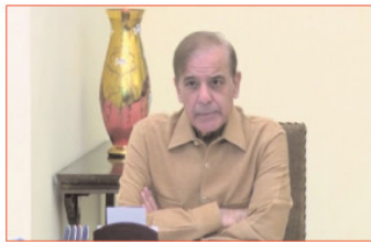
Prime Minister Shehbaz Sharif during a meeting with coalition partners.

This was disclosed by JUI-F Maulana Fazlur Rehman and Pakistan Peoples Party (PPP) Chairman