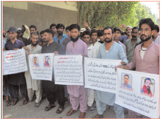
HYDERABAD: Residents of Jamshoro's Pathan Goth are holding a protest at the Hyderabad Press Club against police high-handedness.

tyrs with an annual rally on this date. He announced that a significant rally will take place in Hyderabad at the Hatari Ground, which has hosted previous PPP events. Chairman Bilawal Bhutto selected Hyderabad for this rally due to its historical significance in the struggle for democracy. He stated that the event would demonstrate that the government belongs to the people and will be led by elected representatives.