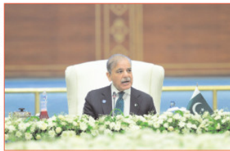
Prime Minister Shehbaz Sharif addressing the nation.

The prime minister said that their government had always placed the people at the heart of every policy. "Through our social