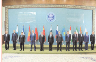
SCO member state leaders at the SCO Council of Heads of Government meeting.

The event was chaired by Prime Minister Muhammad Shehbaz Sharif and was attended by the leaders from the SCO member states including China's Premier of the State Council Li Qiang, Prime Minister of Belarus Roman Golovchenko, Prime Minister of Kazakhstan Olzhas Bektenov, Russian Prime Minister Mikhail Mishustin, Tajik Prime Minister Kohir Rasulzoda, Uzbek Prime Minister Abdulla Aripov, Kyrgyzstan's Chairman of Ministers' Cabinet Zhaparov Akybek, Trade Minister of Iran Seyyed Mo-