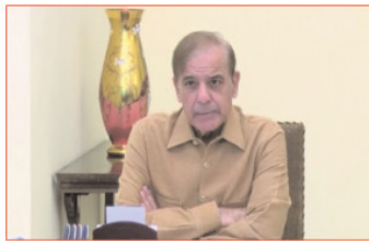
Bilawal Bhutto Zardari while addressing a joint presser in Karachi.

This was disclosed by JUI-F Maulana Fazlur Rehman and Pakistan Peoples Party (PPP) Chairman