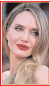
Ageless and Bradless Jolie: Angelina's Secrets to Defying Time Unveiled!