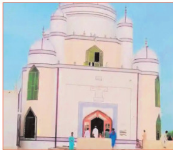
Sindh. Thousands of devotees from across Sindh and the country are expected to attend. However, there are concerns about the lack of basic facilities, such as clean drinking water and accommodations for visitors. Police have set up posts along roads from Badin district to ensure safety and manage the influx of pilgrims, though there are reports of them collecting fees under various pretexts from attendees. The festival is anticipated to draw significant crowds, with many people expected to bring offerings to the shrine, contributing to the vibrant atmosphere of the Urs.