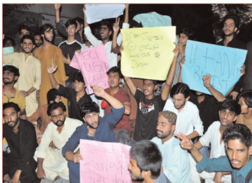
HYDERABAD: Members and leaders of the civil society are holding a protest at the Hyderabad Press Club against the alleged rape of a first-year female student by a security guard.