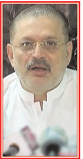
Pakistan Set To Boost EV-Bike Exports: Sharjeel