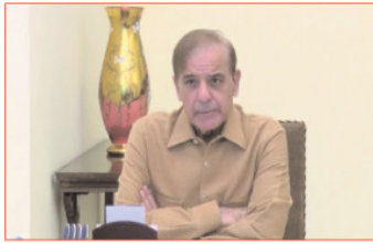
Bilawal Bhutto Zardari while addressing a joint presser in Karachi.

This was disclosed by JUI-F Maulana Fazlur Rehman and Pakistan Peoples Party (PPP) Chairman