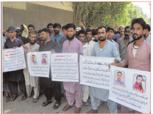
HYDERABAD: Residents of Jamshoro's Pathan Goth are holding a protest at the Hyderabad Press Club against police high-handedness.

HYDERABAD: Provincial Minister Jam Khan Shoro held a press conference regarding the PPP's rally on October 18. He recalled the tragic bombing during Shaheed Mohtarma Benazir Bhutto's welcome procession on October 18, 2007, in Karachi, which resulted in the deaths of several party workers. Shoro emphasized that the PPP honors its mar-