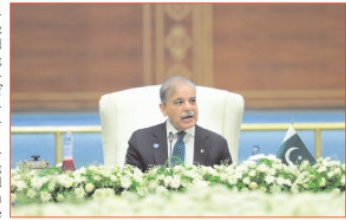
Prime Minister Shehbaz Sharif.

safety net initiatives, we have made significant progress in alleviating poverty and ensuring that our most vulnerable citizens are supported. We believe that lifting people out of poverty is not just about immediate relief but about creating sustainable pathways to economic empowerment. Our targeted efforts aim at empowering communities, especially women and children, and giving them the tools they need to build a better future."