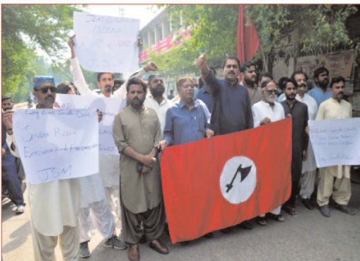
HYDERABAD: Members and leaders of Jeay Sindh Mahaz are holding a protest demonstration for the acceptance of their demands, at the Hyderabad press club.