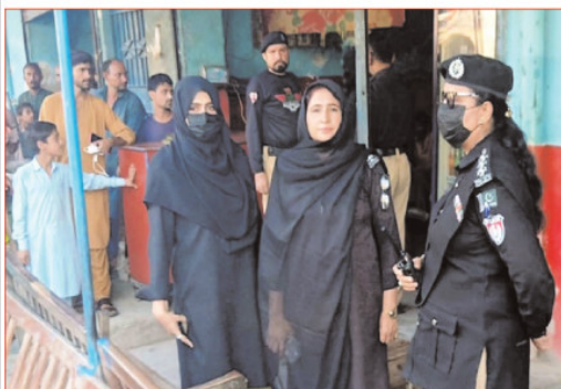
LARKANA: Police officials are carrying out a combing search operation against criminals as security has been heightened in the city.