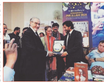
Pir Illahi Bux, celebrated as a pioneer of modern education in Sindh, served as Education Minister for a decade and was the Chief Minister of Sindh from 1948 to 1949.