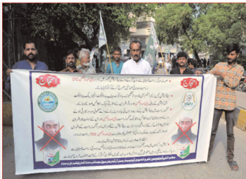
HYDERABAD: Members and leaders of Kissan Welfare Forum are holding a protest demonstration for the acceptance of their demands, at the Hyderabad press club.