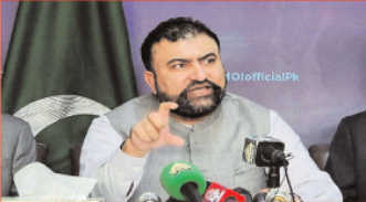
By Abid Mahmood Ch