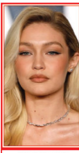
Gigi Hadid steps out in show-stopping looks in NYC