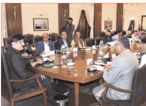
KARACHI: Sindh Chief Minister, Syed Murad Ali Shah met with the elected office-bearers of the National Press Club Islamabad, at the CM House.