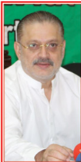
Sharjeel Slams PTI For Promoting Political Instability Amid International Visits