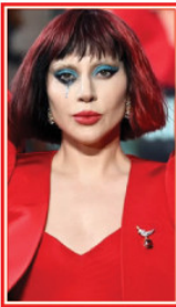
Lady Gaga Falls Short of Outshining 'Gina Riley's Iconic Take' on 'The Joker'?