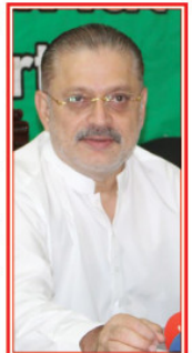
Sharjeel Slams PTI For Promoting Political Instability Amid International Visits