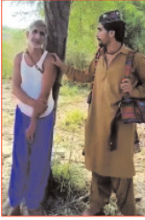
By Kamran Hidayat

According to police sources, after receiving the NOC from the federal government, the Sindh Police have purchased military-grade weapons and technical equipment for the ongoing Katcha operation in the districts of Shikarpur and Kandhkot-Kashmore. The advanced weaponry includes drones capable of carrying warhead payloads that can