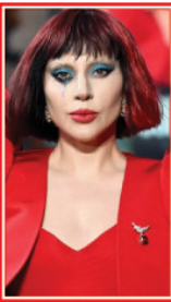
Lady Gaga Falls Short of Outshining 'Gina Riley's Iconic Take' on 'The Joker'?