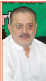
Sharjeel Slams PTI For Promoting Political Instability Amid International Visits