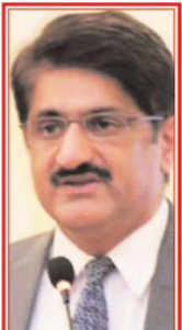
Murad Prizes Global And Local Growers At Inaugural Pakistan International Date Palm Festival 2024