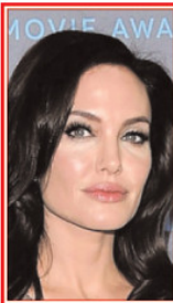
Angelina Jolie on Edge as Jennifer Aniston's Social Circle Tightens Grip