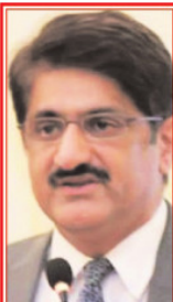
Murad Prises Global And Local Growers At Inaugural Pakistan International Date Palm Festival 2024

KARACHI Edition Vol. XV No 284 Regd. No. 114 visit us at