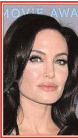
Angelina Jolie on Edge as Jennifer Aniston's Social Circle Tightens Grip