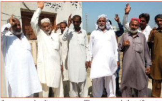
They warned that if water theft by upstream farmers continues and the situation does not improve, they will escalate their protests significantly.