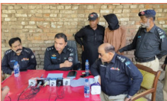
dictated the case was a blind murder, with no evidence found at the crime scene. Using modern technology, police tracked down the suspect, who allegedly sold the stolen gold to a jeweler in Pir Jo Goth. The suspect has confessed to the crime, and further investigations are ongoing. He will be presented in court for further proceedings following judicial orders.