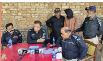
dictated the case was a blind murder, with no evidence found at the crime scene. Using modern technology, police tracked down the suspect, who allegedly sold the stolen gold to a jeweler in Pir Jo Goth. The suspect has confessed to the crime, and further investigations are ongoing. He will be presented in court for further proceedings following judicial orders.