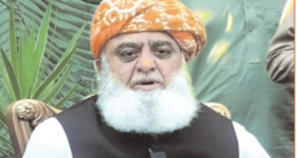
Miankhal were the dissenting judges.

Three judges — then-CJP Umar Ata Bandial, then Justice Ijazul Ahsan, and Justice Munib Akhtar — had voted in favour whereas Justice Jamal Khan Mandokhail and Justice Mazhar Alam Khan