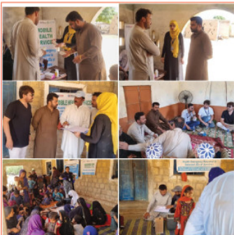
Jamshoro has been in contact with me for the last three days, and in case of any emergency, patients will be admitted to LUMHS Hospital in Jamshoro.