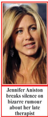
Jennifer Aniston breaks silence on bizarre rumour about her late therapist