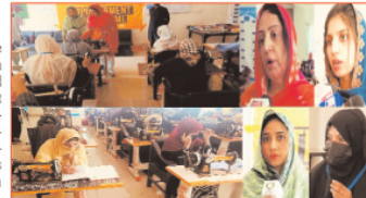
By Naz Solangi

KUMB: In Khairpur, a free sewing center and beautician course have been launched for women through a joint initiative by the Indus Community Empowerment Foundation and the local administration at the Ladies Gymkhana. The first session aims to train 100 women.