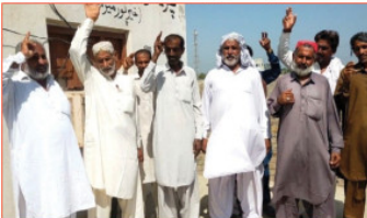
They warned that if water theft by upstream farmers continues and the situation does not improve, they will escalate their protests significantly.