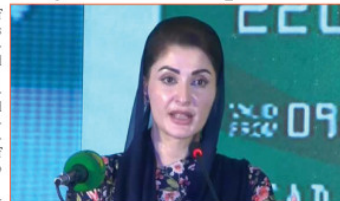
Speaking at the inauguration ceremony, she expressed her gratitude for the realisation of another dream, emphasizing the inclusion of 65,000 special persons into the mainstream. The government has allocated Rs2.6 billion for the project and after every three months the funds will be increased. Additionally, Himat Card holders will enjoy free metro bus travel.

LAHORE: Punjab Chief Minister Maryam Nawaz has launched the Himat Card initiative for differently-abled individuals in the province.