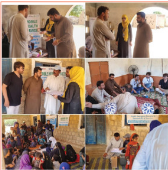
Jamshoro has been in contact with me for the last three days, and in case of any emergency, patients will be admitted to LUMHS Hospital in Jamshoro