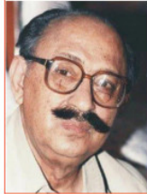
known for his revolutionary spirit and dedication to Sindh. Different programs will be organized to celebrate the birthday of the spiritual leader of the Sarwari Jamaat.