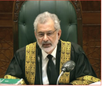
Justice Naem Akhtar Afghan was included.

The court said that Justice Mansoor Ali Shah had voluntarily excused himself from the bench, following which