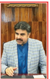
Sindh Minister Highlights Government's Commitment To Boost Small And Medium Enterprises At Microsoft Conference