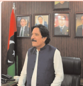
By Khuda Bux Brohi

THATTA: Sindh Minister Haji Ali Hassan Zardari, elected from Thatta, attended a crucial meeting of the Standing Committee on Communications in Islamabad, chaired by Aijaz Jakhani. Zardari emphasized the swift completion of the 24-kilometer national highway connecting Gharo to Keeti Bandar and the urgent reconstruction of the historic New Baran Bridge on the Thatta-Hyderabad National Highway, built in 1860,