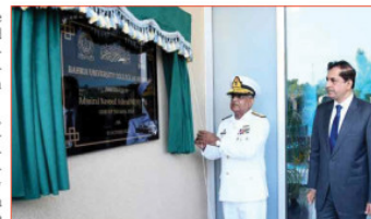
Speaking on the occasion, Admiral Naveed Ashraf appreciated the Bahria University's services and achievements in providing quality education in various fields, a Pakistan Navy news release said.

ISLAMABAD: Chief of the Naval Staff Admiral Naveed Ashraf on Thursday inaugurated Bahria University College of Medicine (BUCM) in the Federal Capital.