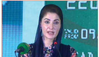
holders will enjoy free metro bus travel. Highlighting economic progress under PML-N, CM Maryam criticised the previous government for inflation. She also condemned PTI's leadership for unrest and accused them of hindering public service.—RT/Agency

LAHORE: Punjab Chief Minister Maryam Nawaz has launched the Himat Card initiative for differently-abled individuals in the province. Speaking at the inauguration ceremony, she expressed her gratitude for the realization of another dream, emphasizing the inclusion of 65,000 special persons into the mainstream. The government has allocated Rs2.6 billion for the project and after every three months the funds will be increased. Additionally, Himat Card