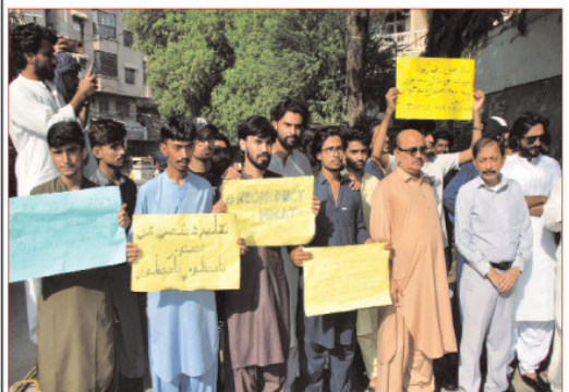
HYDERABAD: Students are holding a protest demonstration for the re-taking of the MDCAT, at the Hyderabad press club.-RT