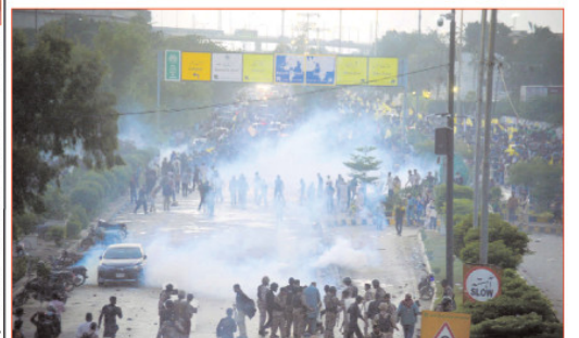
KARACHI: View of the clash between security officials and supporters of the Majlis Wahdat-ul-Muslimeen (MWM) and Inmama Students Organization (ISO) during a protest rally against the killing of Hassan Nasrallah, Chief of Hezbollah in an Israeli Airstrike in Beirut, outside the US Consulate building. Police fired tear gas to stop people from marching towards the US consulate in Karachi. They stopped protesters near the Mai Kolachi Bridge by placing containers.