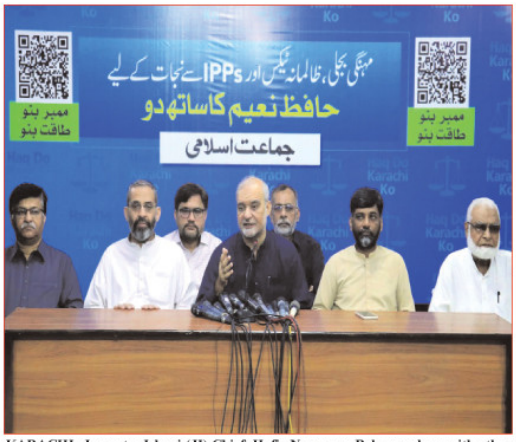
KARACHI: Jamaat-e-Islami (JI) Chief, Hafiz Naeem-ur-Rehman along with other party leaders is addressing a press conference, at the Idara-e-Noor-ul-Haq.