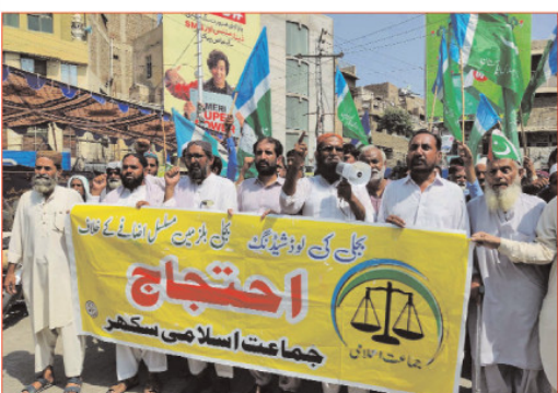
SUKKUR: Activists and leaders of the Jamaat-e-Islami (JI) are holding a protest demonstration against prolonged electricity load shedding and inflated electricity bills.