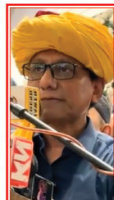
Bilawal Bhutto Has Achieved A Milestone By Building Consensus For New Constitutional Court: Saeed Ghani