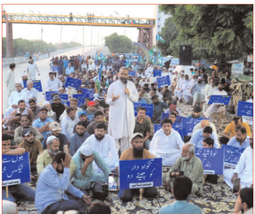
KARACHI: Leader and activists of the Jamaat-e-Islami (JI) are holding a protest demonstration against prolong load shedding and inflated electric bills, in Malir.