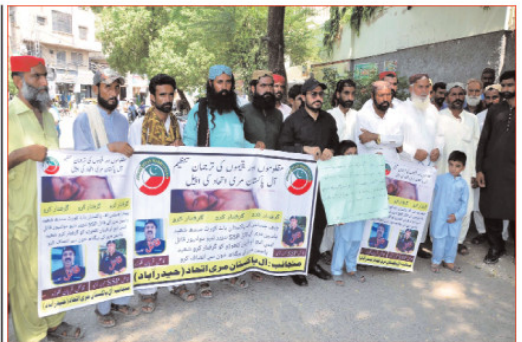
HYDERABAD: Members and leaders of the All Pakistan Marri Ittehad are holding a protest demonstration against the Sindh police department, at the Hyderabad press club-RT

water facilities, severely impacting their quality of life. The protesters expressed their discontent with the municipal committee's inaction, emphasizing that while the administration has historically provided free water delivery to homes through pipelines, the current situation reflects a blatant disregard for residents' needs. They warned that if elected representatives and the district administration do not take immediate steps to restore water supply through existing pipelines in the twelve wards of Bholhari, they will escalate their protests. The demonstrators vowed to widen the scope of their protests, indicating that they would mobilize greater support from the community and potentially engage in more disruptive actions if their demands for equitable water access are not met promptly. The situation remains tense as residents call for urgent governmental intervention to resolve the water crisis and dismantle the exploitative practices of the tanker mafia.