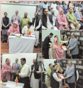
TANDO MUHAMMAD KHAN: A group of people at a signing ceremony, with one person signing a document.

TANDO MUHAMMAD KHAN: A significant step towards improving healthcare in Tando Muhammad Khan was marked by the signing of a Memorandum of Understanding (MOU) between DHQ Hospital Tando Muhammad Khan and the Fatimid Foundation. The ceremony, held at Fatimid's Head Office in Karachi, aims to strengthen pathology services and provide free blood transfusions to thalassemia patients at DHQ Hospital.