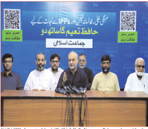
KARACHI: Jamaat-e-Islami (JI) Chief, Hafiz Naeem-ur-Rehman along with other party leaders is addressing a press conference, at the Idara-e-Noor-ul-Haq.

Karachi Mayor Murtaza Wahab reported that approximately 17.86 million square feet of road area was affected during the rainfall. He noted that around Rs1.5 billion is required for the repair and reconstruction of damaged roads, bridges, and flyovers, a request that the Chief Minister promptly approved, directing that quality work be carried out.