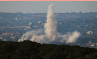
Israel said it bombed Houthi targets in Yemen on Sunday, expanding its confrontation with Iran's allies in the region after killing the Hezbollah leader Sayyed Hassan Nasrallah on Friday in an escalating conflict in Lebanon. The airstrikes on Yemen's port of Hodeidah were in response to Houthi missile attacks on Israel in recent days, Israel said, amid fears that Middle East fighting could spin out of control and draw in Iran and Israel's main ally the United States.

The strikes took place as Israel attacked more targets in Lebanon, where its intensifying bombardment over two weeks has killed a string of top Hezbollah leaders and driven hundreds of thousands of people from their homes. Lebanon's Health Ministry said Israeli strikes on Sunday had killed 24 people in Ain Deleb in the south and 21 people in Baalbek-Hermel in the east and that 14 medics had been killed in airstrikes over the past two days. Israeli drones hovered over Beirut overnight and for much of Sunday, with the loud blasts of new airstrikes echoing around the Lebanese capital. Hezbollah and Israel have been trading fire across the border since the start of the war in Gaza, which was triggered by the Oct. 7 attack by Hamas militants. Yemen's Houthis have launched sporadic attacks on Israel throughout that time and disrupted Red Sea shipping. Israel rapidly ramped up its attacks on Hezbollah two weeks ago with the declared goal of making northern areas safe for residents to return to their homes, killing much of the group's leadership.—Agency