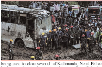
KATHMANDU: Residents of Nepal's flood-hit capital returned to their mud-caked homes on Sunday to survey the wreckage of devastating floods that have killed at least 170 people across the Himalayan republic.

KATHMANDU: Residents of Nepal's flood-hit capital returned to their mud-caked homes on Sunday to survey the wreckage of devastating floods that have killed at least 170 people across the Himalayan republic. Deadly rain-related floods and landslides are common across South Asia during the monsoon season from June to September, but experts say climate change is increasing their frequency and severity. Entire neighbourhoods in Kathmandu were inundated over the weekend with flash floods reported in rivers coursing through the capital and extensive damage to highways connecting the city with the rest of Nepal.