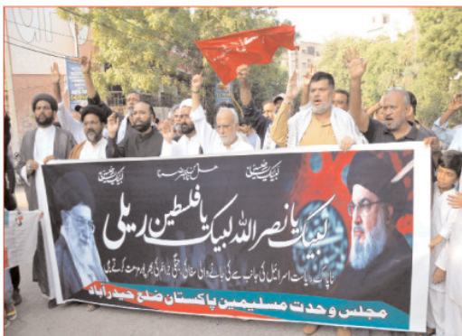
HYDERABAD: Members and leaders of the Majlis Wahdat-ul-Muslimeen (MWM) are holding a protest demonstration against the killing of Hassan Nasrallah in Lebanon.