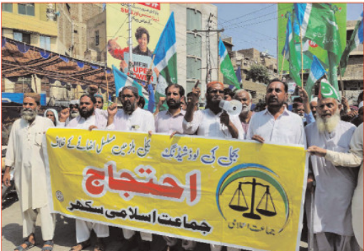
SUKKUR: Activists and leaders of the Jamaat-e-Islami (JI) are holding a protest demonstration against prolonged electricity load shedding and inflated electricity bills.-RT