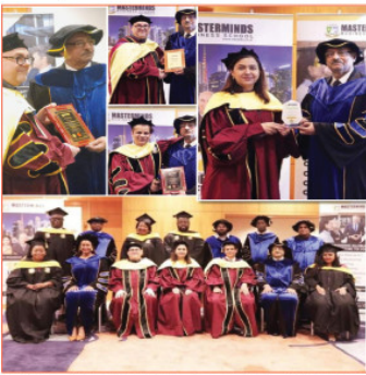
SHAHDADPUR: A group of people at a leadership conference, with one person receiving an award.