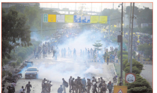
KARACHI: View of the clash between security officials and supporters of the Majlis Wahdat-ul-Muslimeen (MWM) and Inamia Students Organization (ISO) during a protest rally against the killing of Hassan Nasrallah, Chief of Hezbollah in an Israeli Airstrike in Beirut, outside the US Consulate building. Police fired tear gas to stop people from marching towards the US consulate in Karachi. They stopped protesters near the Mai Kolachi Bridge by placing containers.