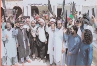
THARI MIRWAH: A group of people in white clothing protesting, holding signs and banners.