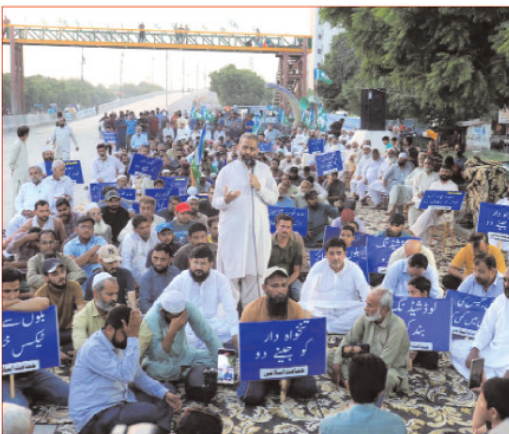
KARACHI: Leader and activists of the Jamaat-e-Islami (JI) are holding a protest demonstration against prolong load shedding and inflated electric bills, in Malir.