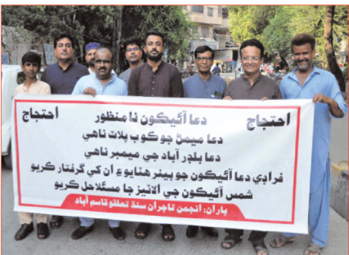
HYDERABAD: Members and leaders of the Anjuman-e-Tajran Qasimabad are holding a protest demonstration for the acceptance of their demands, at the Hyderabad press club.