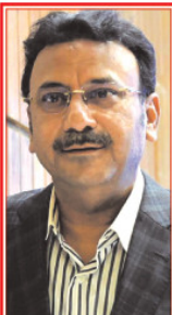
Sindh Home Minister Inaugurates Online Driving License Issuance