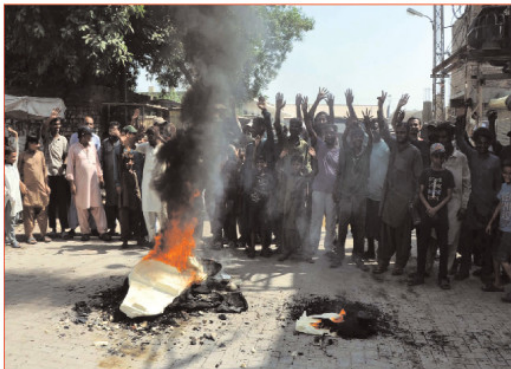
HYDERABAD: Residents of Goods Naka are blocking the main road and are burning tires while holding a protest demonstration against prolonged electricity load shedding in their area.