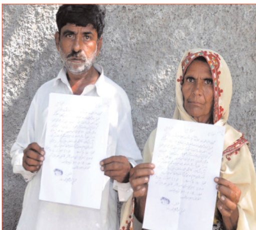
HYDERABAD: Residents of Husri are holding a protest demonstration against the highhandedness of their area's influential people, at the Hyderabad press club.