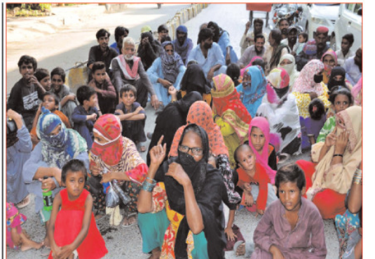
HYDERABAD: Residents of Jinnah Colony are holding a protest demonstration for acceptance of their demands, at the Hyderabad press club.