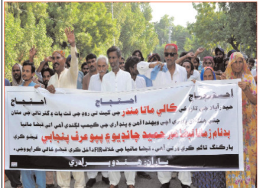
HYDERABAD: Members and leaders of the Hindu Community are holding a protest demonstration against land grabbers, at the Hyderabad press club.