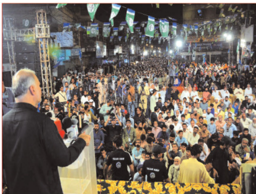
HYDERABAD: Jamaat-e-Islami Chief, Hafiz Naeem-ur-Rehman is addressing his supporters during a public gathering held at Kohinoor Chowk.