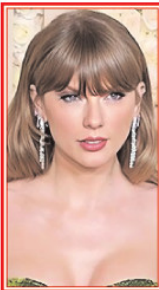
Taylor Swift takes Travis Kelce to be her new 'muse'