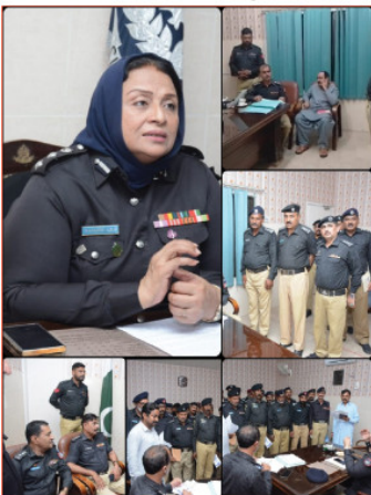
maintaining law and order in Sindh. Officers and personnel of the RRF have sacrificed their lives to protect the safety and dignity of citizens and to combat crime. She expressed hope that the selected officers would demonstrate their best capabilities in uprooting crime, upholding the rule of law, and establishing peace and order. She also mentioned that the selected officers would receive an RRF allowance.