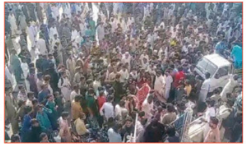
extrajudicial killing that would not be tolerated. They demanded the arrest of all officials involved in the incident and called for a judicial inquiry into the matter. Meanwhile, efforts to reach the SSP for a response were unsuccessful as he did not answer calls.