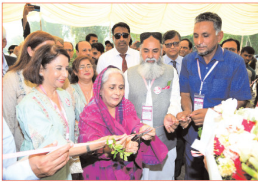
LARKANA: Sindh Minister for Health, Dr Azra Fazal Pechubo is inaugurating the international conference on family planning at SMBMMU.