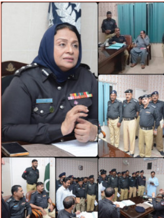
maintaining law and order in Sindh. Officers and personnel of the RRF have sacrificed their lives to protect the safety and dignity of citizens and to combat crime. She expressed hope that the selected officers would demonstrate their best capabilities in uprooting crime, upholding the rule of law, and establishing peace and order. She also mentioned that the selected officers would receive an RRF allowance.