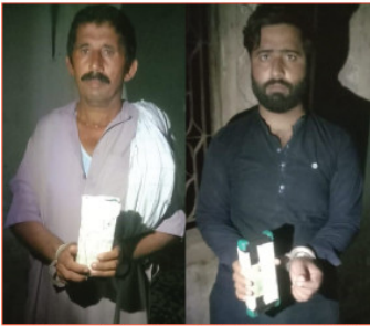
arrested the culprits. However, several other influential device holders remain free from any action.