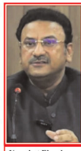
Umerkot Blasphemy Suspect Killed In 'Staged' Police Encounter: Sindh Home Minister

KARACHI Edition Vol. XV No 276 Regd. No. 114 visit us at