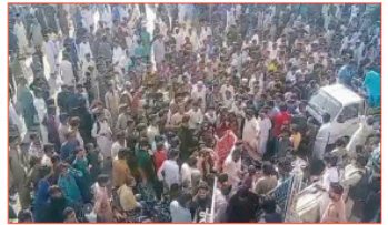
extrajudicial killing that would not be tolerated. They demanded the arrest of all officials involved in the incident and called for a matter. Meanwhile, efforts to reach the SSP for a response were unsuccessful as he did not answer calls.