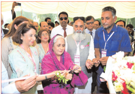
LARKANA: Sindh Minister for Health, Dr Azra Fazal Pechubo is inaugurating the international conference on family planning at SMBBMU.