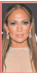
Jennifer Lopez's 'secret attempts' amid Ben Affleck split revealed