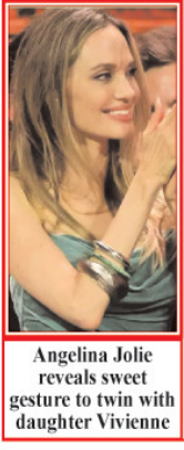
Angelina Jolie reveals sweet gesture to twin with daughter Vivienne