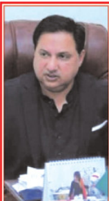
Dherejo Takes Action Against Unsafe Disposal Of Industrial Waste