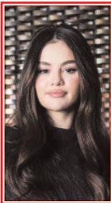
Selena Gomez finally addresses engagement rumors with a staunch clapback