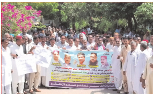
LARKANA: Members and leaders of the Primary Teachers' Association are protesting in favor of their demands outside the Larkana Press Club.