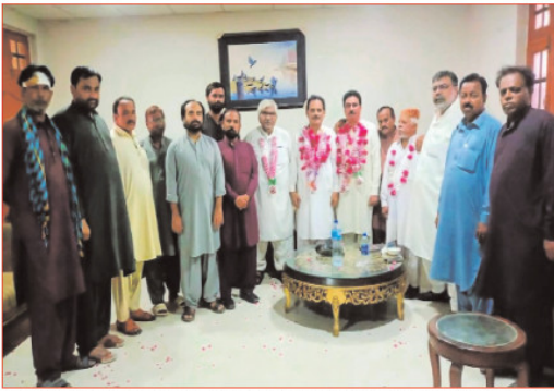
SEHWAN SHARIF: A group photo shows the newly elected office-bearers of the National Press Club Sehwan Sharif.