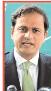
Wabab Promises To Resolve Municipal Issues Before Rabi' al-Awwal