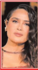
Salma Hayek says she was 'afraid' to star in Angelina Jolie's 'Without Blood'