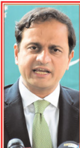
Wabab Promises To Resolve Municipal Issues Before Rabi' al-Awwal