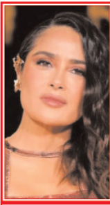
Salma Hayek says she was 'afraid' to star in Angelina Jolie's 'Without Blood'