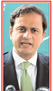
Wabab Promises To Resolve Municipal Issues Before Rabi' al-Awwal