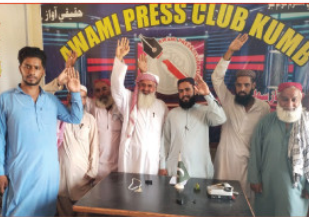
The leaders alleged that, in celebration of 12 Rabi-ul-Awwal, they had put up flags, but at night, the SHO forcibly removed their flags, which they claimed was illegal. They warned the SHO that if their flags were not restored, they would hold a sit-in protest against him, which would continue until his transfer.