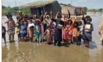
village is plagued by diseases and the situation has become unbearable due to mosquito bites and stagnant water. The villagers have warned that if the rainwater is not drained, they will continue their protests and have already boycotted the anti-polio campaign, sending the polio vaccination teams back.