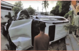
(East) granted the suspect bail against a surety bond of Rs100,000.

KARACHI: The heirs of the victims of the Karsaz road accident have pardoned the suspect involved in the incident, stating that they have no objection to the granting of bail as the mishap was unintentional. "Matters have been settled between us, and we have pardoned the suspect. We have forgiven for the sake of Allah, the Most Kind and Most Merciful," read the affidavit submitted to the court during a hearing of the suspect's bail plea.