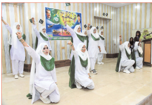
LARKANA: Students are presenting in a tableau to celebrate Pakistan Defense Day at the Government Girls Degree College in the City.