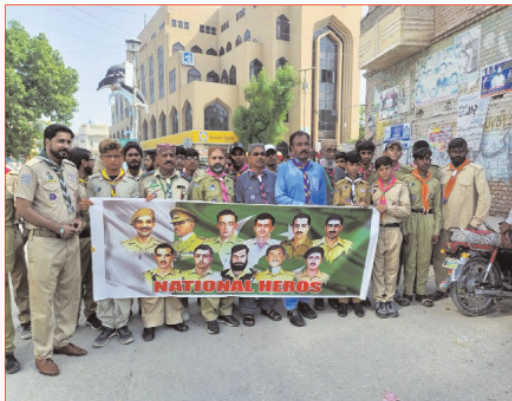
LARKANA: The leaders and members of the District Boys Scouts Association Larkana are taking out a rally to celebrate Defence Day.

filling the atmosphere with patriotism and national pride. Traditional gifts were presented to the Chief Guest and other dignitaries, marking a memorable conclusion to the celebrations. This Defence Day, Cadet College Petaro honored the nation's heroes, rekindling the spirit of courage, sacrifice, and valor that defines Pakistan's history. The commemoration served as a poignant reminder of the nation's unwavering commitment to its sovereignty, territorial integrity, and the bravery of its armed forces.