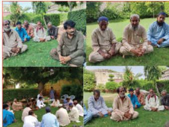
of the Khaskheli community or any other community support would be provided based on humanitarian principles. The organization pledged to voice concerns against injustice on every platform and take a stand against oppression.