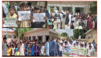
Secondary said that the brave soldiers of the Pakistan Army have made great sacrifices to protect our country. These sacrifices are being remembered and honored across the country today. The Pakistan Army is a world-renowned force that continually safeguards our borders for national security and defense.