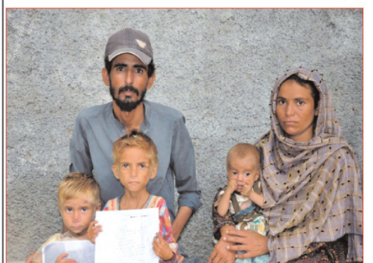
HYDERABAD: Residents of Mehar stage a protest at Hyderabad Press Club against the high-handedness of influential individuals in their area.