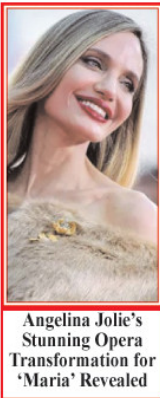
Angelina Jolie's Stunning Opera Transformation for 'Maria' Revealed