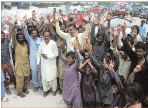
HYDERABAD: Members of the All Pakistan Marble Association block the road in protest against prolonged electricity load shedding and demand the replacement of the electric transformer in their area.