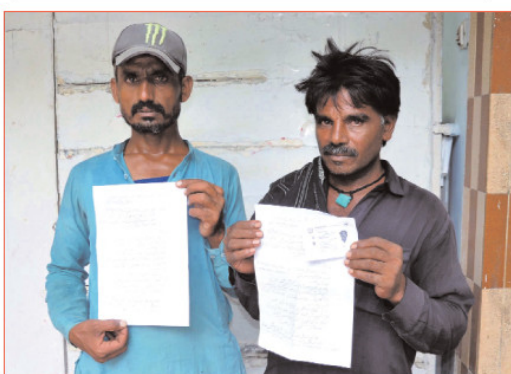
HYDERABAD: Residents of Hosri hold a protest at Hyderabad Press Club, demanding their grievances be addressed.