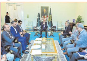
Prime Minister Shehbaz Sharif (right) meeting with MQM-Pakistan delegation.

Prime Minister Shehbaz assured the delegation of swift action on their demands. The MQM-P also urged the prime minister to intensify efforts to recover