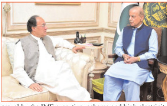
Prime Minister Shehbaz Sharif (left) and IMF representative (right) during a meeting.

Meanwhile, in a televised message today, Federal Minister for Finance and Revenue, Senator Muhammad Aurangzeb, stated that Pakistan had already signed a Staff Level Agreement (SLA) with the IMF and was in the advanced stages of securing the agreement's approval by the IMF executive board.