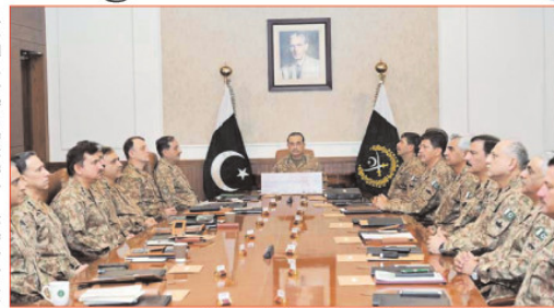
Meeting of military leadership in Rawalpindi.

hard-earned successes against terrorism to be reversed," it added. Pakistan's armed forces launched intelligence-based operations (IBOs) in the southwestern Balochistan province in response to attacks by insurgents that martyred over 50 people on August 26, the ISPR said last week.