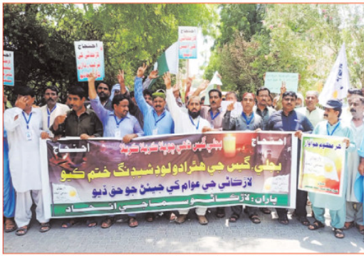
LARKANA: Members and leaders of the Larkana Social Alliance are holding a protest rally against prolonged electricity and gas load shedding in the district, at Jinnah Bagh