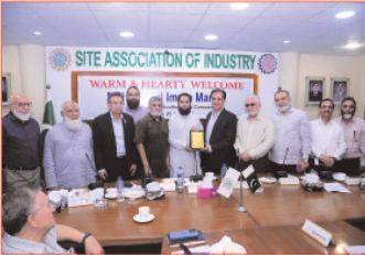
By Asif Qureshi

KARACHI: The SITE Association of Industry members praised SSGC Managing Director Muhammad Imran Maniar for the completion of a dedicated 24-inch, 31-kilometer high-pressure gas pipeline for industrial consumers in the SITE area. The new pipeline addresses the long-standing issue of low or zero gas pressure.