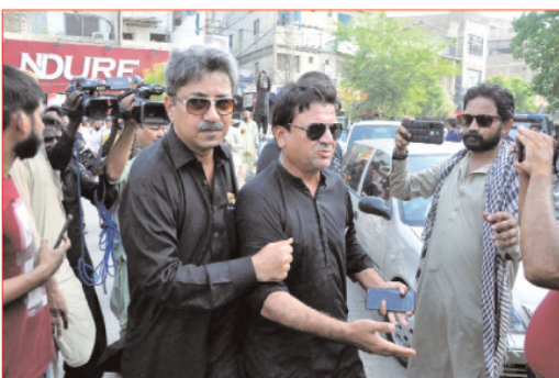
HYDERABAD: Police officials are arresting activists and leaders of the PTI during their protest demonstration for the release of PTI Founder Imran Khan, at Hyder Chowk.