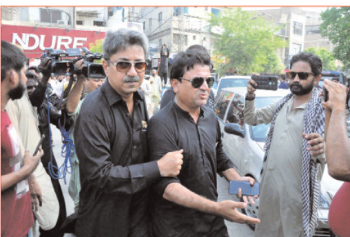
HYDERABAD: Police officials are arresting activists and leaders of the PTI during their protest demonstration for the release of PTI Founder Imran Khan, at Hyder Chowk.