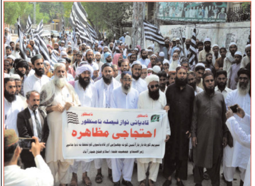
HYDERABAD: Activists and leaders of the Jamiat Ulema-e-Islam (JUI-F) are holding a protest demonstration at the Hyderabad Press Club against the Supreme Court's decision in the Mubarak Sani case.—RT