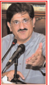
Murad Approves Rs16 Million Grant And Vehicles For Pakistan Association Of The Blind