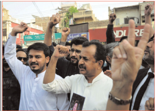
HYDERABAD: Activists and leaders of PTI are holding a protest demonstration for the release of PTI Founder Imran Khan, at Hyder Chowk.

THATTA: Leaders, workers and well-wishers of the Pakistan People's Party (PPP) gathered at Zamin House to celebrate the 69th birthday of President of Pakistan, Asif Ali Zardari. Born on July 26, 1955, in Nawabshah, Zardari has been a pivotal figure in Pakistani politics and is recognized for his unwavering dedication to democracy and his significant contributions to the country's political landscape. Zardari's efforts have ensured the stability and endurance of democracy in Pakistan and set a high standard of wisdom, tolerance and decency in politics. His dedication to reconciliation and democratic principles has been instrumental in navigating Pakistan through immense challenges, securing a prosperous future for the nation.