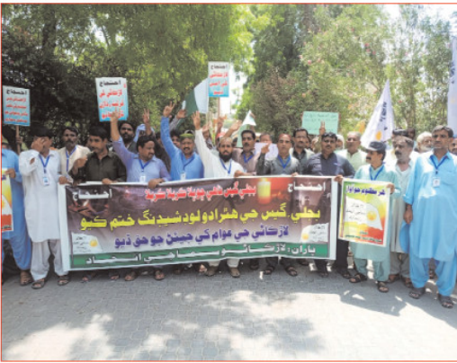
LARKANA: Leaders of the Larkana Social Alliance are protesting against prolonged load shedding of gas and electricity in Larkana.