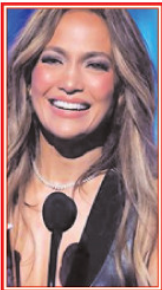
Jennifer Lopez returns to the Big Apple post birthday celebration