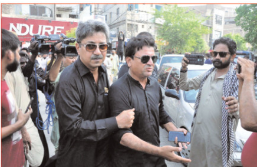
HYDERABAD: Police officials are arresting activists and leaders of the PTI during their protest demonstration for the release of PTI Founder Imran Khan, at Hyder Chowk.