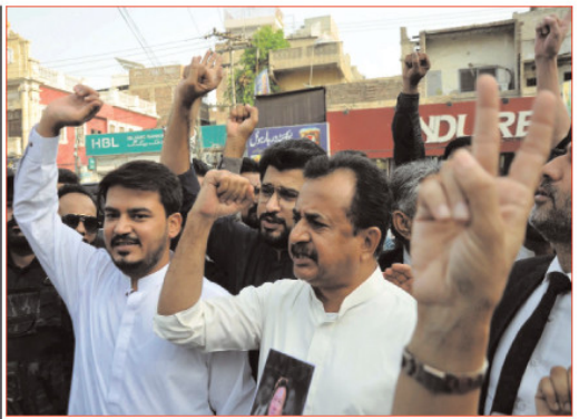
HYDERABAD: Activists and leaders of PTI are holding a protest demonstration for the release of PTI Founder Imran Khan, at Hyder Chowk.

THATTA: Leaders, workers and well-wishers of the Pakistan People's Party (PPP) gathered at Zamin House to celebrate the 69th birthday of President of Pakistan, Asif Ali Zardari. Born on July 26, 1955, in Nawabshah, Zardari has been a pivotal figure in Pakistani politics and is recognized for his unwavering dedication to democracy and his significant contributions to the country's political landscape. Zardari's efforts have ensured the stability and endurance of democracy in Pakistan and set a high standard of wisdom, tolerance and decency in politics. His dedication to reconciliation and democratic principles has been instrumental in navigating Pakistan through immense challenges, securing a prosperous future for the nation.