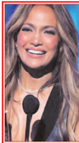
Jennifer Lopez returns to the Big Apple post birthday celebration