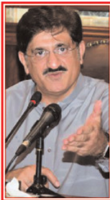
Murad Approves Rs16 Million Grant And Vehicles For Pakistan Association Of The Blind

KARACHI Edition Vol. XV No 215 Regd. No. 114 visit us at