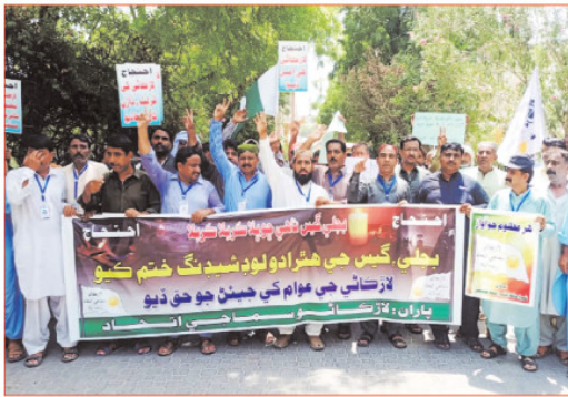
LARKANA: Members and leaders of the Larkana Social Alliance are holding a protest rally against prolonged electricity and gas load shedding in the district, at Jinnah Bagh-RT