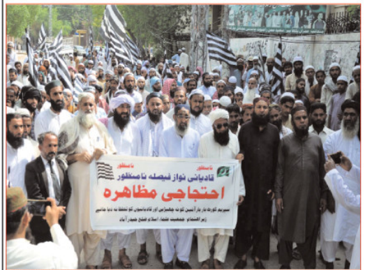
HYDERABAD: Activists and leaders of the Jamiat Ulema-e-Islam (JUI-F) are holding a protest demonstration at the Hyderabad Press Club against the Supreme Court's decision in the Mubarak Sani case.