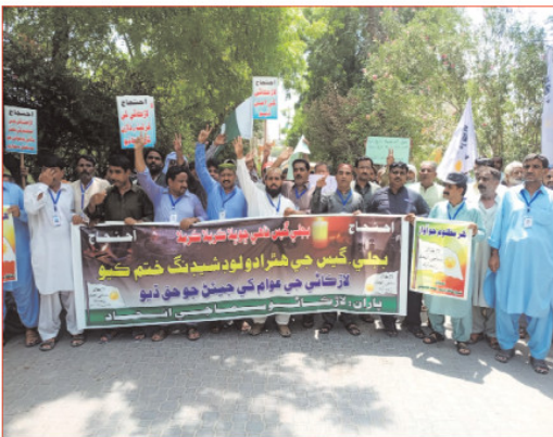
LARKANA: Leaders of the Larkana Social Alliance are protesting against prolonged load shedding of gas and electricity in Larkana.