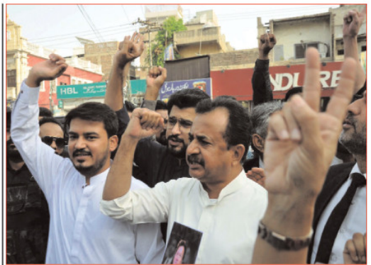
HYDERABAD: Activists and leaders of PTI are holding a protest demonstration for the release of PTI Founder Imran Khan, at Hyder Chowk.

THATTA: Leaders, workers and well-wishers of the Pakistan People's Party (PPP) gathered at Zamin House to celebrate the 69th birthday of President of Pakistan, Asif Ali Zardari. Born on July 26, 1955, in Nawabshah, Zardari has been a pivotal figure in Pakistani politics and is recognized for his unwavering dedication to democracy and his significant contributions to the country's political landscape. Zardari's efforts have ensured the stability and endurance of democracy in Pakistan and set a high standard of wisdom, tolerance and decency in politics. His dedication to reconciliation and democratic principles has been instrumental in navigating Pakistan through immense challenges, securing a prosperous future for the nation.