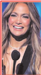
Jennifer Lopez returns to the Big Apple post birthday celebration