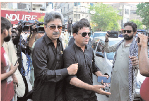
HYDERABAD: Police officials are arresting activists and leaders of the PTI during their protest demonstration for the release of PTI Founder Imran Khan, at Hyder Chowk.