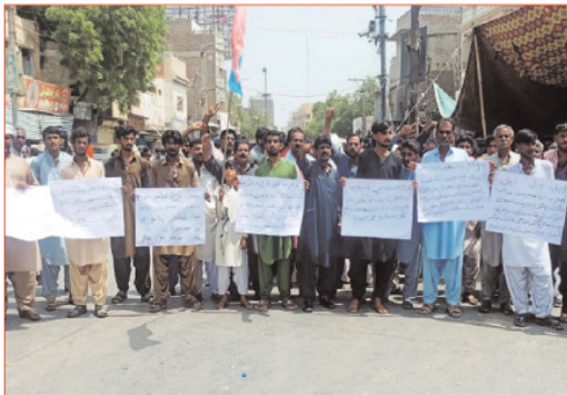
LARKANA: Members and leaders of the Sindh Mallah Forum are holding a protest demonstration for the acceptance of their demands, at Jinnah Bagh Chowk in Larkana.