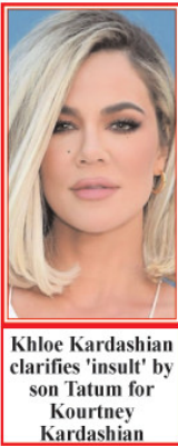
Khloe Kardashian clarifies 'insult' by son Tatum for Kourtney Kardashian