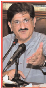
Murad Orders Immediate Release Of Rs1bn For Needy Minority Families

KARACHI Edition Vol. XV No 214 Regd. No. 114 visit us at