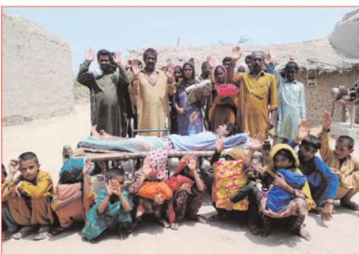
LARKANA: Residents of Alhanda Mirbahar village are holding a protest demonstration against the highhandedness of the Aqil Police Station.