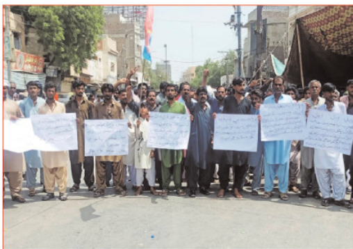
LARKANA: Members and leaders of the Sindh Mallah Forum are holding a protest-demonstration for the acceptance of their demands, at Jinnah Bagh Chowk in Larkana.