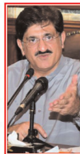
Murad Orders Immediate Release Of Rs1bn For Needy Minority Families

KARACHI Edition Vol. XV No 214 Regd. No. 114 visit us at