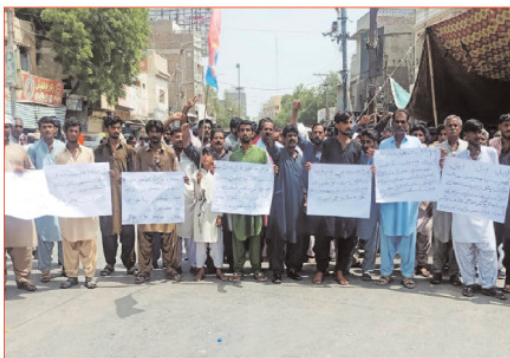
LARKANA: Members and leaders of the Sindh Mallah Forum are holding a protest demonstration for the acceptance of their demands, at Jinnah Bagh Chowk in Larkana.