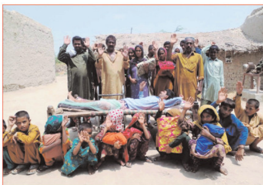
LARKANA: Residents of Alhanda Mirbahar village are holding a protest demonstration against the highhandedness of the Aqil Police Station.