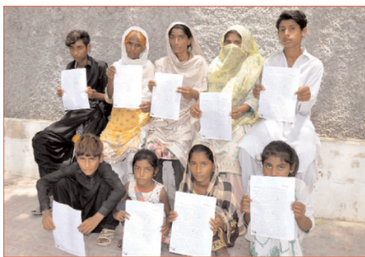
HYDERABAD: Residents of Badin are holding a protest demonstration against the abduction of their community girl.