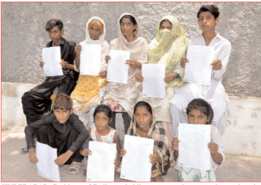
HYDERABAD: Residents of Badin are holding a protest demonstration against the abduction of their community girl.-RT