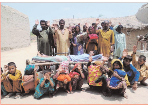
LARKANA: Residents of Alhanda Mirbahar village are holding a protest demonstration against the highhandedness of the Aqil Police Station.