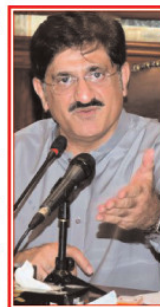
Murad Orders Immediate Release Of Rs1bn For Needy Minority Families