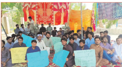
LARKANA: Students of Chandka Medical College hold a protest demonstration on campus to demand the acceptance of their demands.