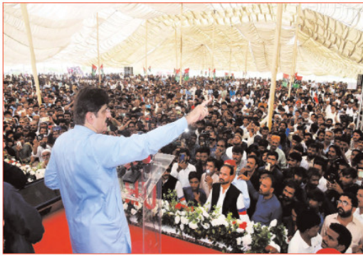
BADIN: Sindh Chief Minister Syed Murad Ali Shah speaks during the inauguration ceremony of the LBOD System, developed to revive old waterways.