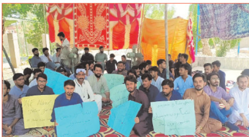
LARKANA: Students of Chandka Medical College hold a protest demonstration on campus to demand the acceptance of their demands.