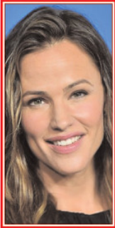
Jennifer Garner Unveils New Modeling Venture