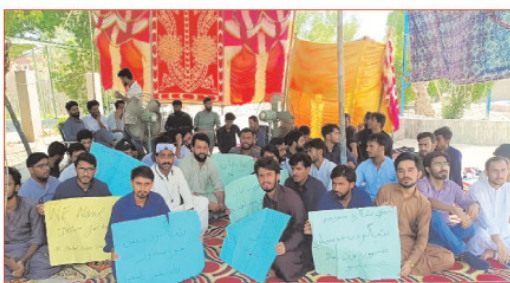
LARKANA: Students of Chandka Medical College hold a protest demonstration on campus to demand the acceptance of their demands.