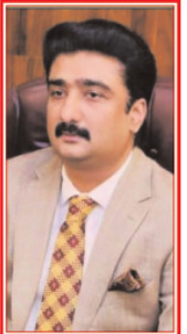
Dozens Of Pakistanis Deported From Iraq Over Fake Visas