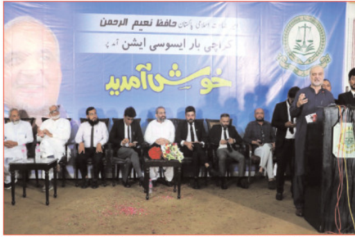
KARACHI: Jamat-e-Islami (JI) Chief Hafiz Na'eem-ur-Rehman addresses lawyers at a reception ceremony organized by the Karachi Bar Association, held at City Courts premises.