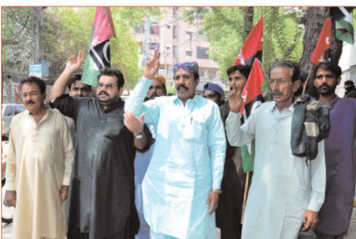
HYDERABAD: Members and leaders of the Asif Zardari and Faryal Talpur Release Committee are holding a protest demonstration for acceptance of their demands, at the Hyderabad press club.