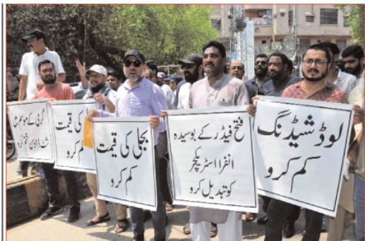
HYDERABAD: Residents of Latifabad are holding a protest demonstration against prolonged electricity load shedding in their area, at the Hyderabad press club.