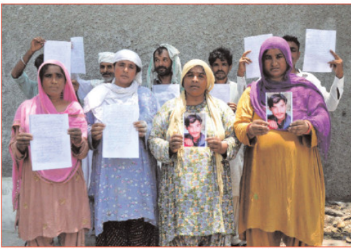
HYDERABAD: Members and leaders of the Bagri Community are holding a protest demonstration for recovery of their missing boy, at the Hyderabad press club.