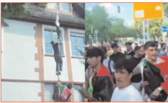
Foreign Office said. According to media reports, the situation has drawn significant attention among the international communities, raising concerns about the diplomatic security of the installations.

"We are conveying our strong protest to the German government and urge to take immediate measures to fulfil its responsibilities under the Vienna Conventions," the