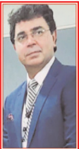
SFA Vigilance Team Uncovers Severe Violations At Suaad Bakery

KARACHI Edition Vol. XV No 210 Regd. No. 114 visit us at