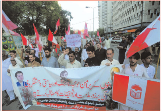
KARACHI: Members and leaders of the National Democratic Movement are holding a protest demonstration against the recent Bannu incident.