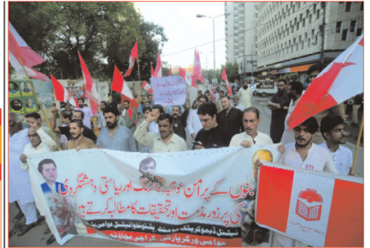
KARACHI: Members and leaders of the National Democratic Movement are holding a protest demonstration against the recent Bannu incident.