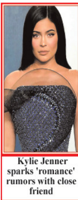
Kylie Jenner sparks 'romance' rumors with close friend