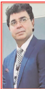
SFA Vigilance Team Uncovers Severe Violations At Suaad Bakery