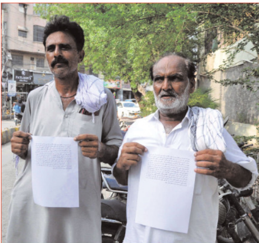
HYDERABAD: Residents of Mirpurkhas are holding a protest demonstration for the acceptance of their demands, at the Hyderabad press club.