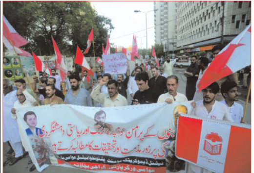
KARACHI: Members and leaders of the National Democratic Movement are holding a protest demonstration against the recent Bannu incident.