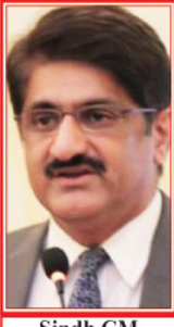
Sindh CM Orders Plan For Renovating KMC Buses