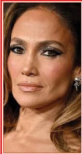
Jennifer Lopez drops another hint at Ben Affleck split with THIS change