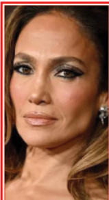
Jennifer Lopez drops another hint at Ben Affleck split with THIS change