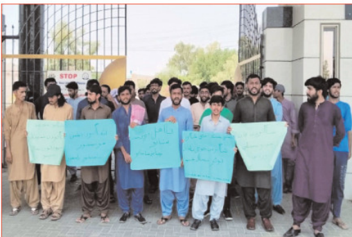
LARKANA: Students of Chandka Medical College are holding a protest demonstration for better basic facilities.