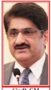
Sindh CM Orders Plan For Renovating KMC Buses