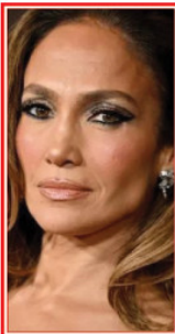
Jennifer Lopez drops another hint at Ben Affleck split with THIS change